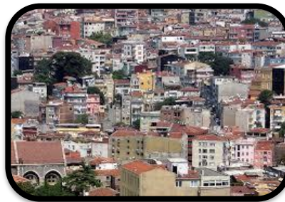
Construction and buildings