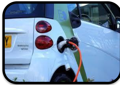
Batteries and vehicles