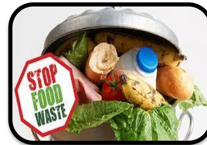
Food, water and nutrients